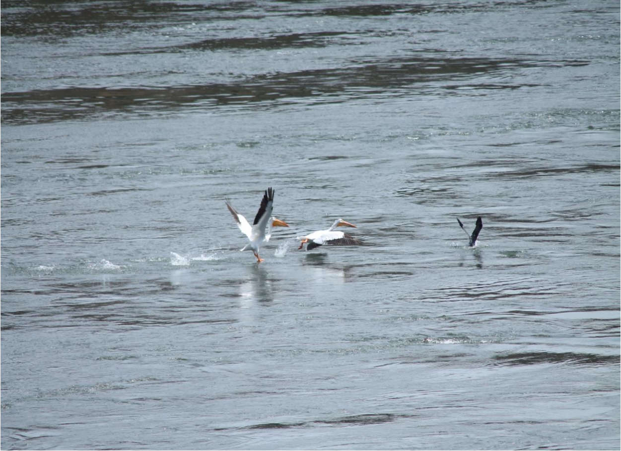
Klepto pelicans hazing gulls for us