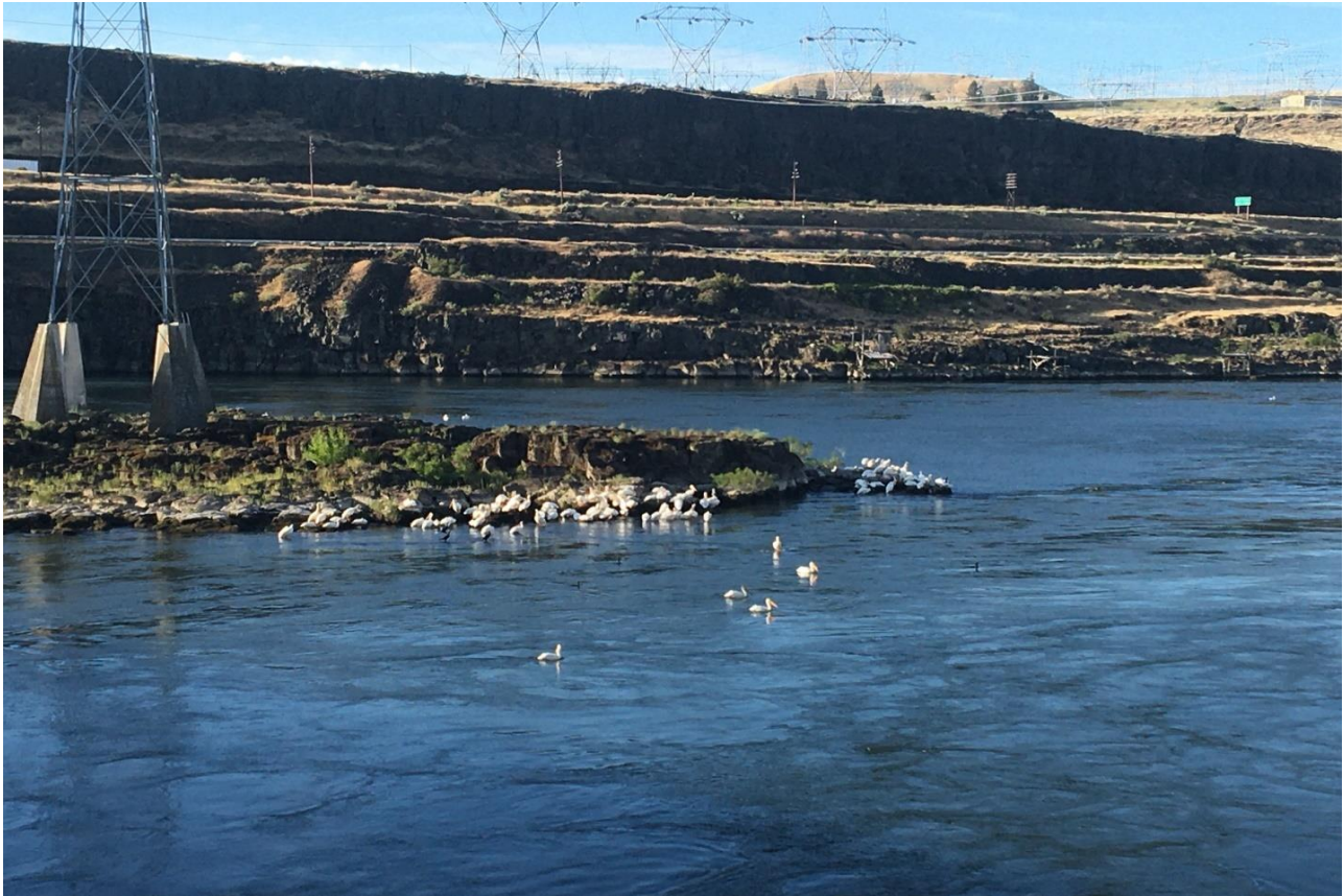
Gaggle of Pelicans near east ladder entrance.